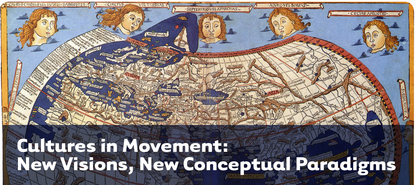
Ecumene (engr. Johannes Schnitzer, 1482).